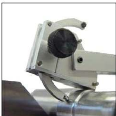
Radial roughness measurement