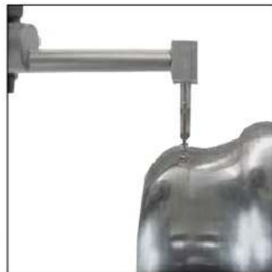
Measuring surface roughness of a polished part