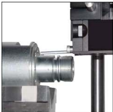
Checking of surface roughness near a shoulder