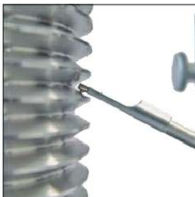
Checking of thread profile roughness of a thread plug gage