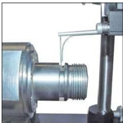
Checking at recessed measuring points